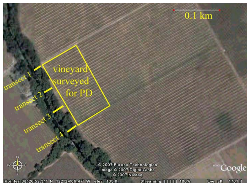
Figure 1. Study design for sampling the plant community composition in riparian areas. We studied 19 randomly selected vineyards in Napa County; each was adjacent to riparian vegetation. In Fall 2005, at each of these sites we examined grapevines for Pierce's disease symptoms and confirmed the presence of Xf by ELISA, with the help of Dr. Barry Hill. In July 2006, we surveyed the riparian vegetation adjacent to each vineyard. At each site, we established four transects. Along each transect, we measured the percent cover per species within each of 20 quadrats (0.5 x 0.5 m; Figure 1). A geographic information system (GIS) was used to measure the amount of residential and winery land within 1.5 km of each site. In 20 quadrants positioned along each of four transects, as drawn in the riparian area pictured at left, we measured percent cover of all riparian species present. The rectangular box in the vineyard section was surveyed for Pierce's disease.

Funding for this project was provided by the CDFA Pierce's Disease and Glassy-winged Sharpshooter Board.