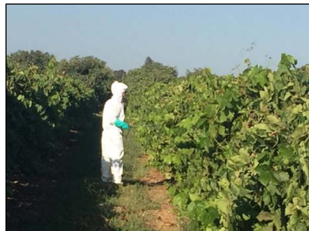
Fig 3: Spraying Movento® in grape vines

We applied the insecticide Movento® at different application timings – as measured by calendar date as well as by weeks before or after harvest (Movento® has a 7 day Pre-Harvest Interval). We applied Movento® at the label rate and determined the percentage kill of mealybugs on different sections of the vine during the summer, fall (completed), and the coming spring (Fig. 3). A standardized application method was used across all vineyards so that surfactant and application rate would not be an influence. At each site, there are 15 replicates (individual vines) per treatment per vineyard, with treatments placed in a complete randomized design.