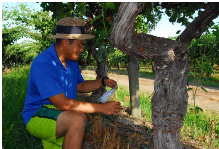
Fig. 2: Sampling trunk live tissue, leaves and petioles, canes, cordons, trunk (above and below girdle when present) and roots.

During 2015 we used bioassays (visual counts of mealybugs) to look at control effectiveness across vineyards in different regions and with different management practices or vine structures (this work was funded via the CDFA PD GWSS project). Commercial vineyards were selected in the central San Joaquin Valley (Fresno County) with four vineyard blocks near Fresno (1 Thompson seedless raisin grapes, 1 Crimson seedless table grapes and 2 Thompson seedless table grapes); the Lodi-Woodbridge wine grape region (Stockton county) with three vineyards near Lodi (1 Cabernet Sauvignon, 1 Pinot Noir, 1 Chardonnay); and North Coast wine grape region (Napa County) with two vineyards at a site in the Carneros region of Napa (1 Pinot Noir, 1 Chardonnay). We are also sampling numerous ‘experimental’ vineyard blocks at the Kearney Agricultural Research and Extension Center that represent wine and table grape blocks undergoing studies for nitrogen, irrigation, and wine grape cultivars. At each site, we have counted mealybug densities on the vine, measured cluster damage and taken vine fresh tissue samples before and after Movento® applications (sections from the leaf, cane and trunk) (Fig 2).