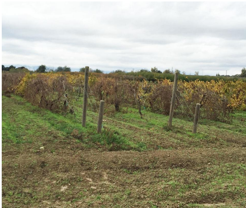
Figure 1. Ready for destruction. Plants at Solano field site November 15, 2016 before removal of posts and wires.

The field experiment that begun in 2010 was terminated under objective 1 of this proposal according to the regulations specified in the APHIS permit (Figures 1 and 2). This will be followed by establishment of second phase approved by the Product Development Committee to develop transgenic rootstocks incorporating stacked genes (dual constructs) to be grafted to non-transformed PD-susceptible Chardonnay