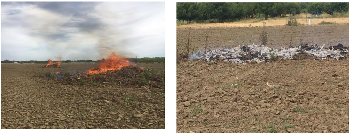
Figure 2. Final destruction of the plants at Solano field site by burning on June 7, 2017 following removal of poles and wires, undercutting and piling of plants

scions to test for potential cross-graft protection against PD (Objective 2). The development of the stacked gene rootstock transgenics is in progress with a preliminary greenhouse evaluation of the transgenic rootstocks for expression of the transgenes and response to the rootstocks to inoculation with X. fastidiosa prior to grafting and establishment in the new field area.