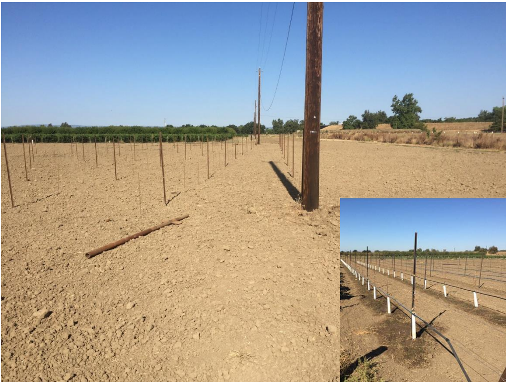
Figure 4. Planting configuration for the dual constructs. The design follows the description in the objectives section. The insert illustrates the new plantings, which will be watered by drip irrigation as seen.