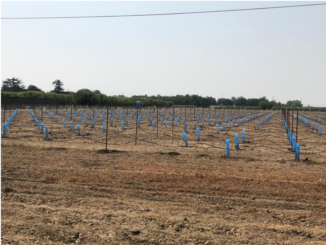
Figure 3. Planting configuration for the dual constructs.. This image illustrates the new planting of the dual construct transformed rootstocks grafted with an untransformed clone of Chardonnay. This first phase of the planting was completed August 1, 2018.

The field plot design will enable experimental X. fastidiosa inoculations, pathogen and disease assessments, as well as grape yield. Land preparation and planting of the experimental area is sufficient to accommodate and manage 900 new plants. Row spacing will be 9 feet between rows with 6 feet between plants. This spacing permits 32 rows of 28 plants each (up to 896 plants total) and includes a 50 foot open space around the planted area as required by the APHIS permit. The planting pattern will permit a 2 bud pruned bilateral cordon system of sufficient lengths for inoculation, real time sampling of inoculated tissue and determination of the fruit yield by the untransformed Chardonnay scions. Total fenced area occupied by plants and buffer zones as required by the APHIS permit will be ~3.4 acres (Figure 2). All plants will be maintained under a newly installed drip irrigation system. An image of the completed phase 1 of the field planting is shown in Figure 3.