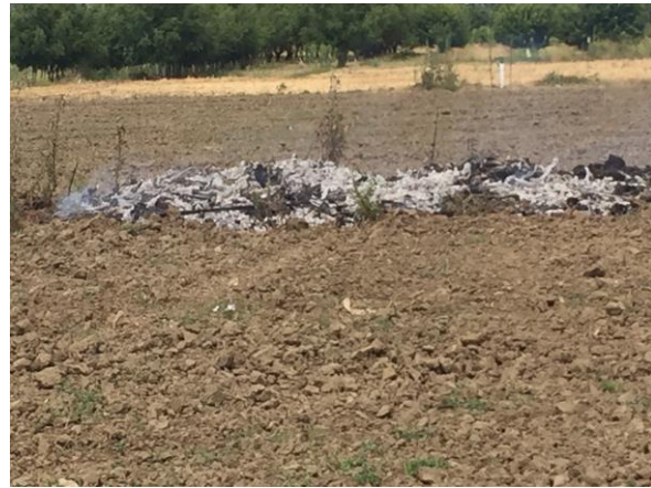
Figure 1. Final destruction of the plants at Solano field site by burning on June 7, 2017 following removal of poles and wires, undercutting and piling of plants, the material was burned and the ashes incorporated by disking.